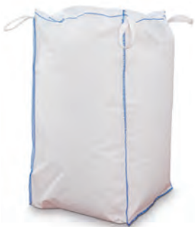
Big Bag with inliner 330 kg | 450 kg per pallet FTL: 26 pallets 20' FCL: 10 pallets | 40' FCL: 22 pallets