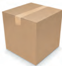
Cardboard Box with sealed polybag | 25 kg 450 kg per pallet FTL: 26 pallets 20' FCL: 10 pallets | 40' FCL: 22 pallets