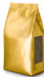
Bags | Sachets Variety of different foil and printing options 15 g – 500 g