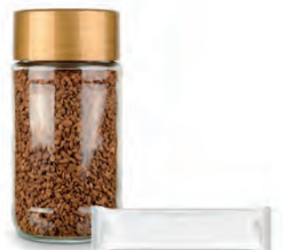
Co-Packing Solutions Jars | Sticks | Doy Packs | Tins